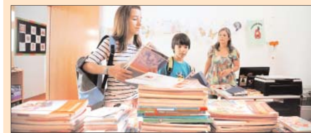
Children deposit textbooks in a book bank at a tutoring centre in Queluz near Lisbon. Struck by a severe crisis in Portugal, many families have opted to exchange textbooks. More than a hundred shops, pharmacies, florists and associations have already volunteered to host a space for textbook storage and exchange. This initiative will allow families to save money while most students in primary education must purchase their textbooks, which represents a budget of around 300 euros per student.