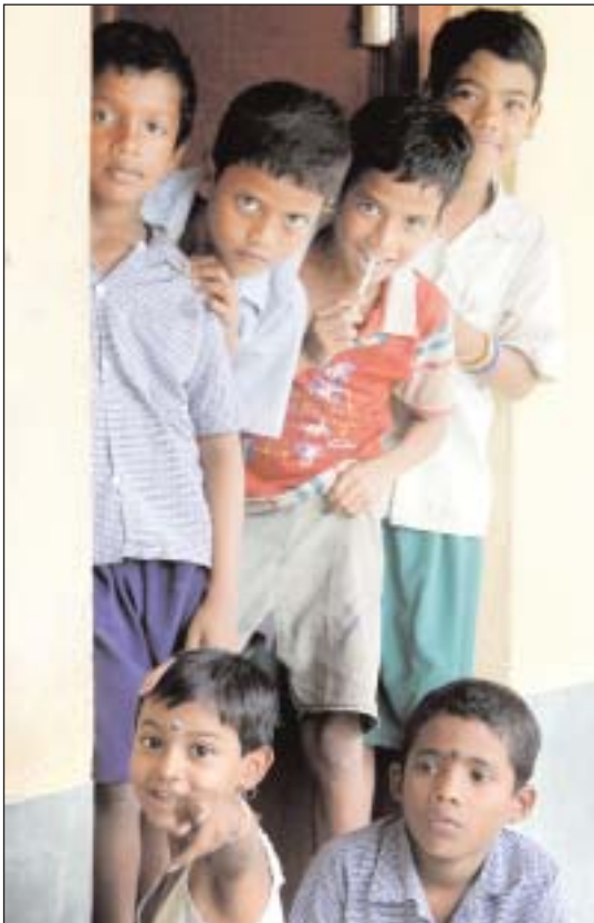
Students at the coaching centre and (right) children wait for their classes to begin.